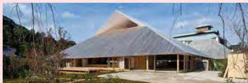
Naoshima Hall Owner: Naoshima Town Architect: Sambuichi Architects