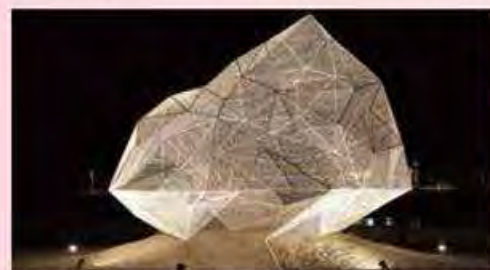
Naoshima Pavilion Owner: Naoshima Town Architect: Sou Fujimoto Architects

■ Access: 20 minutes by ferry from Uno Port ■ Location: Naoshima-cho, Kagawa District, Kagawa ■ Contact: Town-Naoshima Tourism Association, +81-87-892-2299 Website: http://www.naoshima.net/en/