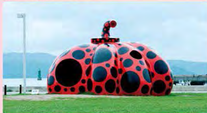
"Red Pumpkin" ©Yayoi Kusama, 2006 Naoshima Miyaura Port Square