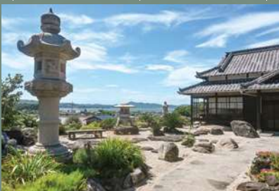
Paradise restored : A window into an island community that fought the power and won