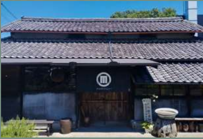
Going back to nature on Shodoshima