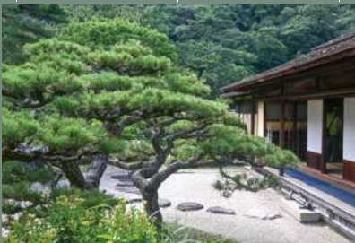
Ritsurin Garden, bonsai and the artisanal culture of Kagawa