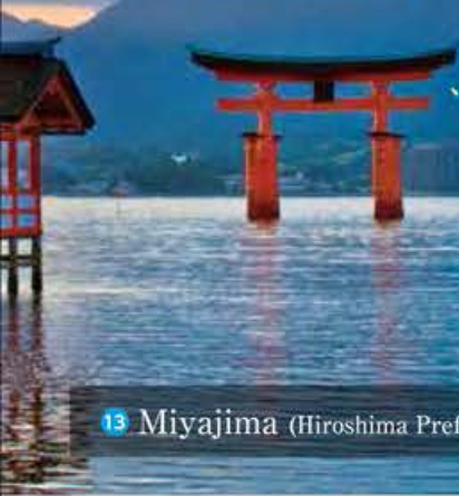
13 Miyajima (Hiroshima Prefecture)