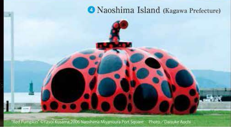
4 Naoshima Island (Kagawa Prefecture)