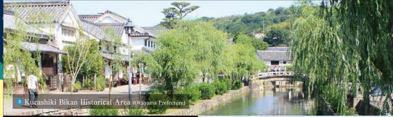
3 Kurashiki Bikan Historical Area (Okayama Prefecture)