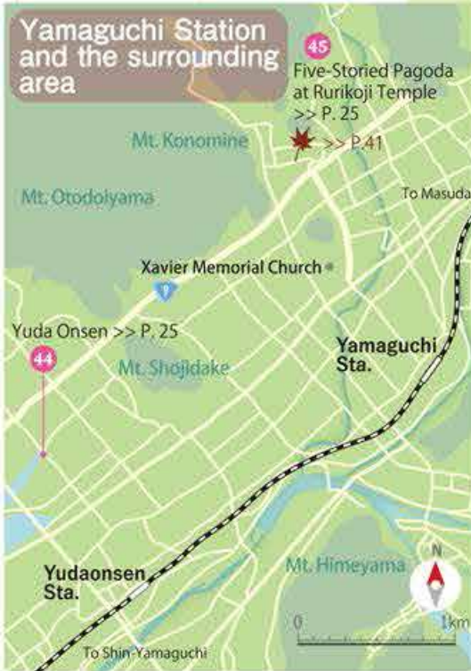
Yamaguchi Station and the surrounding area